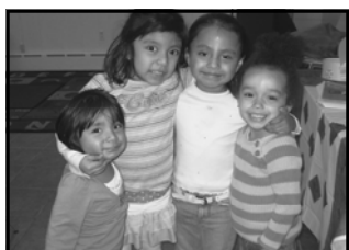
Friends meet at the FRC!